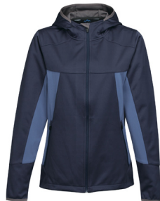
Navy/ Mountain Blue