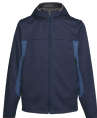
Navy/ Mountain Blue