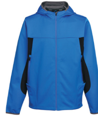
Royal Blue/ Black