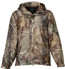
Real Tree AP™