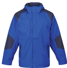
Imperial Blue/ Navy