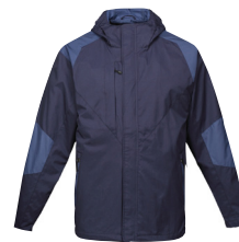
Navy/ Mountain Blue