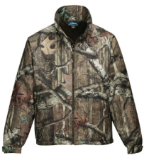
Mossy Oak® Infinity®