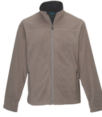
British Tan/ Black