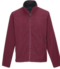
Dark Maroon/ Black