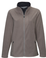
British Tan/ Black