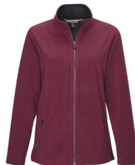
Dark Maroon/ Black