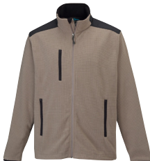
British Tan/ Black