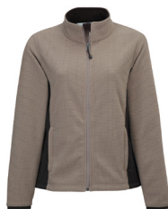
British Tan/ Black