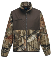
Mossy Oak ® Infinity ®