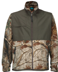
Real Tree AP ™ / Olive