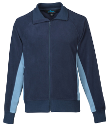
Navy/ Dusk Blue