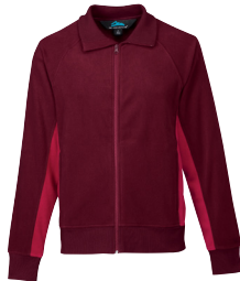
Dark Maroon/ Maroon