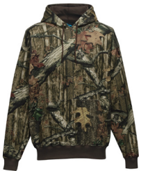
Mossy Oak® Infinity®