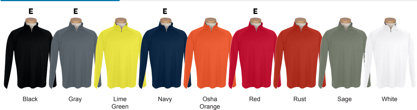
E - Extended Sizes Available