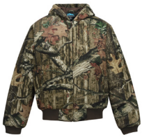
Mossy Oak (R) Infinity (R)